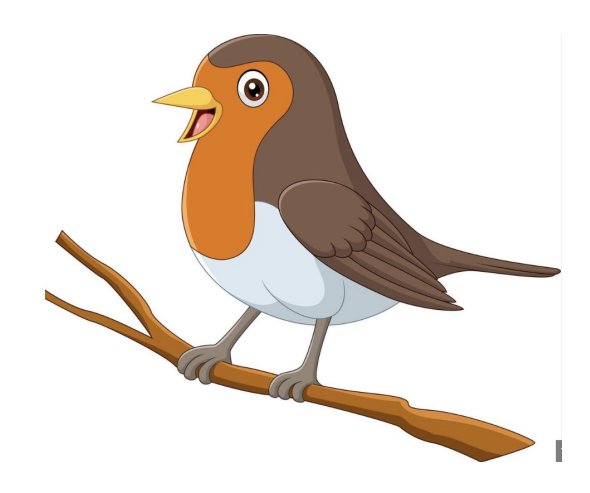
Find Out More...

Full details and a registration form for the portrait offer, which is being funded by central government can be found below.