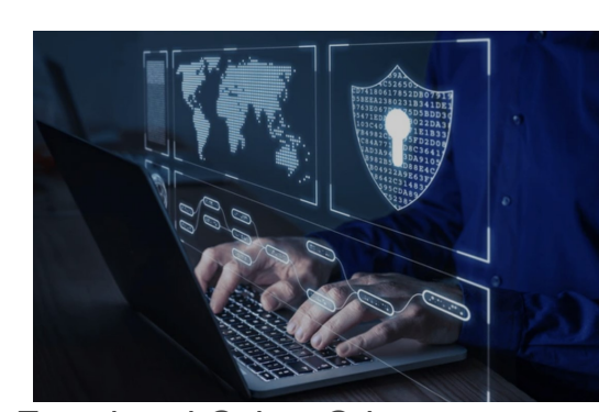
Latest on Fraud and Cyber Crime