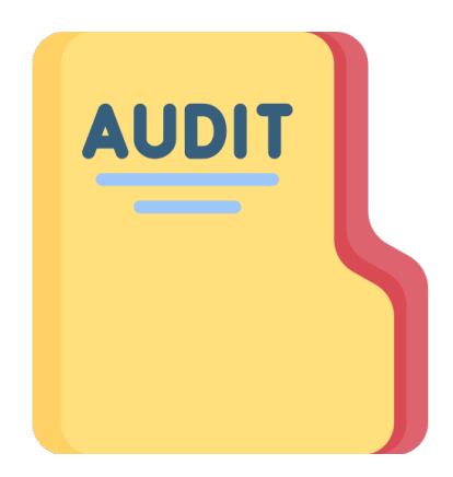
Year End and Audit

Further details and an entry form can be found here.