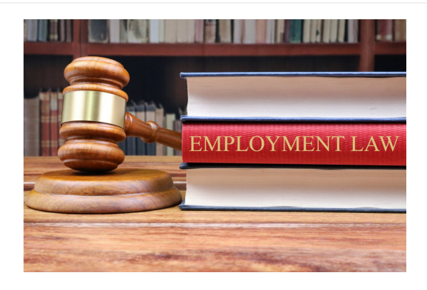
Get Updated - April '24 Employment Law Changes

A number of changes to employment law come into effect this April. These range from start-and-finish times to the right to ask for home-working from day one of employment, and also include new arrangements for paying holiday-pay as part of an hourly rate. We'll be delivering a FREE training session on Wednesday 24th April at 10am. Places for the one-hour course can be booked via the DALC portal.