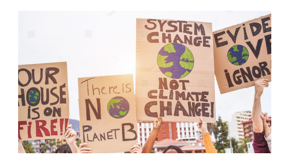
Climate Change Initiative

We are liaising with Derbyshire County Council to develop an easy way to inspire you and to take action to meet your biodiversity and environmental duties. There are also plans to offer a formal Derbyshire-wide accreditation for councils who can evidence climate and biodiversity action.