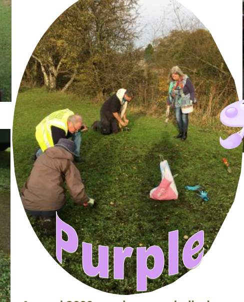
Around 2000 purple crocus bulbs have been planted in the grassed area opposite the Coach and Horses with the help of children from Dronfield Junior School and ladies from Drone Roses WI.