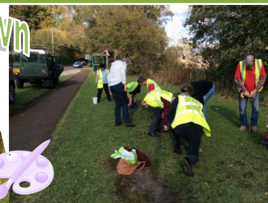
A truly stunning display of crocuses along Eckington Road, Coal Aston.