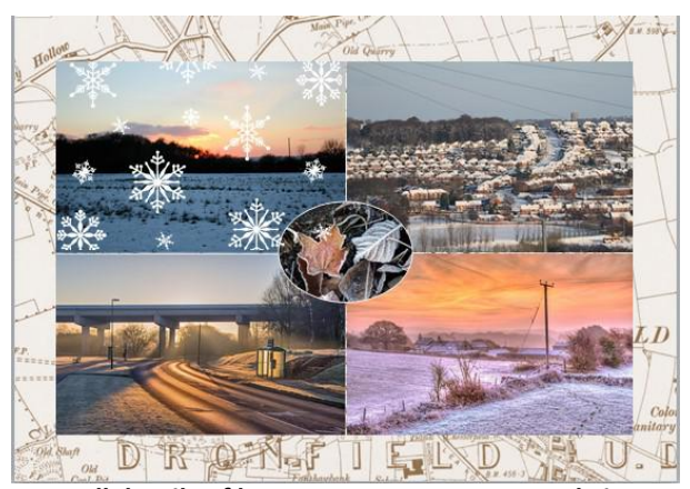
Full details of how to enter are on our website

Have a search through your photographs from last year and take part in the third annual DCS Photographic Competition, in conjunction with Dronfield Camera Club. Our three categories remain the same: Dronfield Life, The Built Environment and Landscape. This year we would really like to see more Junior entrants (14 years and under), so get your cameras clicking and record some of those beautiful, interesting or unusual elements in and around the postcode area of $18. Winners will be announced at the Evening of Celebration in May.