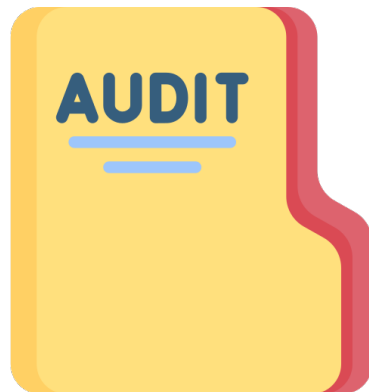
Year End and Audit

Further details and an entry form can be found here.